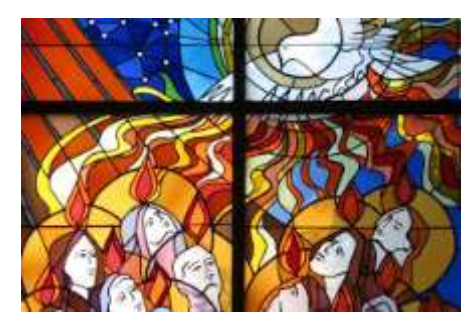
Pentecost Sunday May 19, 2024 10:30 a.m. Worship Service Come and worship in-person or online with us as we celebrate the birth of the early Christian Church.